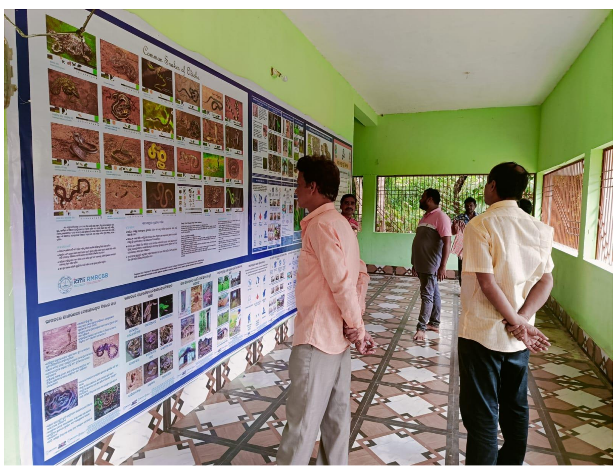
Figure 4: Photo of Information, Education and Communication (IEC) Material at the CaSA Launch Event