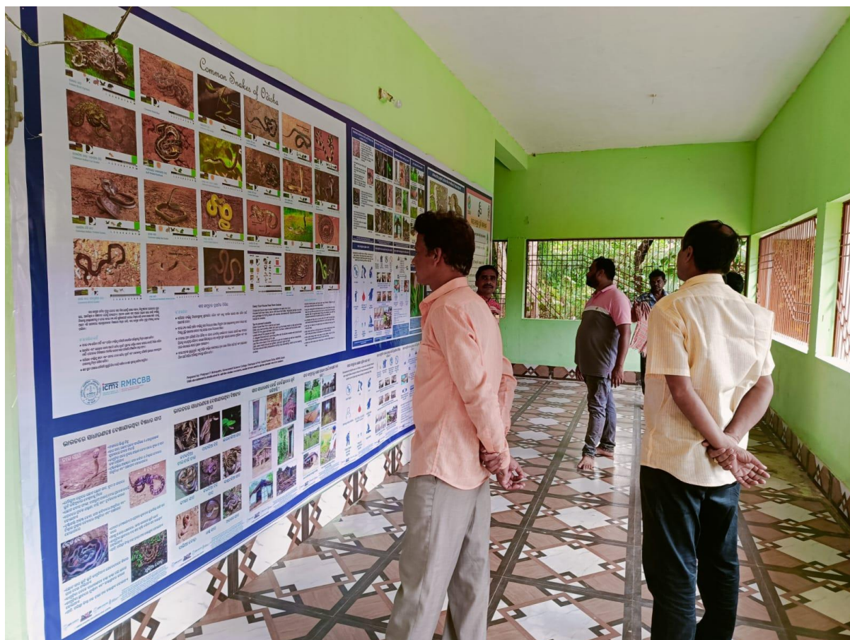
Figure 4: Photo of Information, Education and Communication (IEC) Material at the CaSA Launch Event