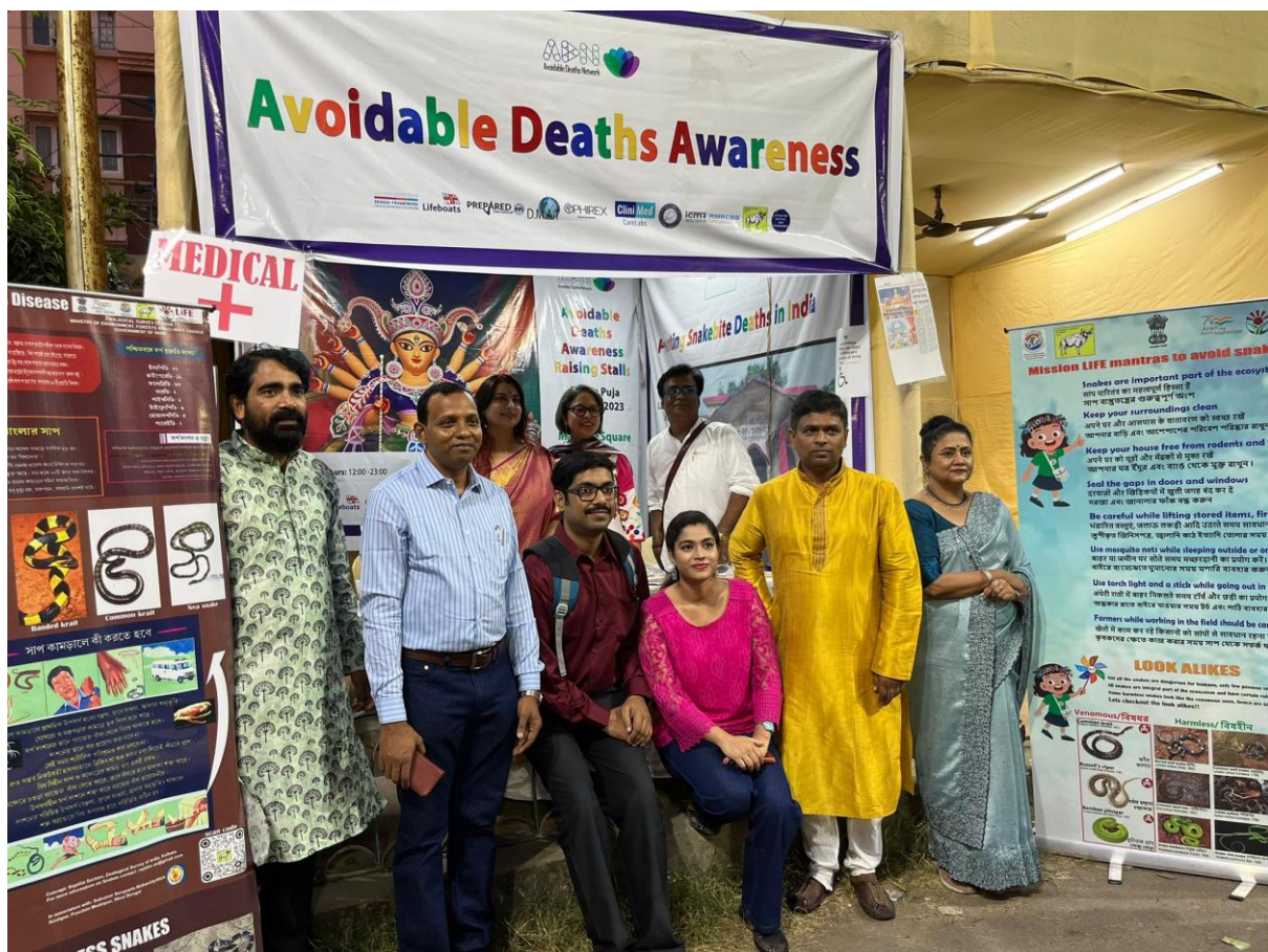
Figure 2 : Group photo at Maddox Square