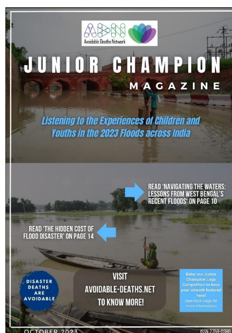
Figure 5: Front Cover of Magazine's first issue